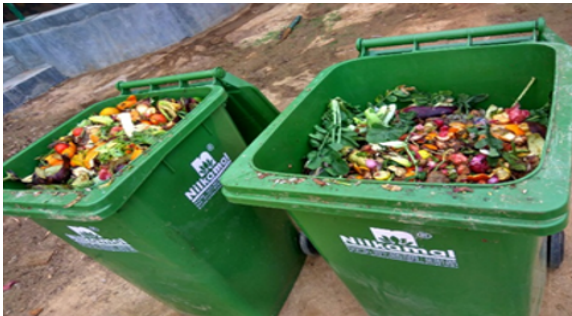
Segregated kitchen waste in IIT Delhi campus

IIT Delhi has dramatically improved its solid waste management in recent years. Waste from domestic, hostels and horticultural sources are collected from campus and biodegradable waste and recyclable waste are segregated. Biodegradable waste is used in biogas generation. A pilot-scale biogas production plant having a capacity of 25 m 3 /day has been established in the Mahatma Gandhi Gramodaya Parisar of IIT Delhi. This plant uses 250 kg of kitchen waste per day, segregated waste collected from various households and hostels inside the campus to produce biogas and compressed biogas (CBG) as demonstration models of proper waste management to produce fuel and biofertilizer for in-campus horticultural application. This activity was taken up under the institute’s initiative “Working Group on Waste Management”. The biogas produced by this plant is being upgraded to a quality of natural gas using a biogas purification and bottling plant situated in Biogas Production and Upgradation Laboratory. The biogas is being also upgraded by a water scrubbing-based system (20 Nm 3 /h of biogas) to upgrade it to natural gas quality fuel. Further, the upgraded CBG is being used as vehicular fuel to substitute CNG.