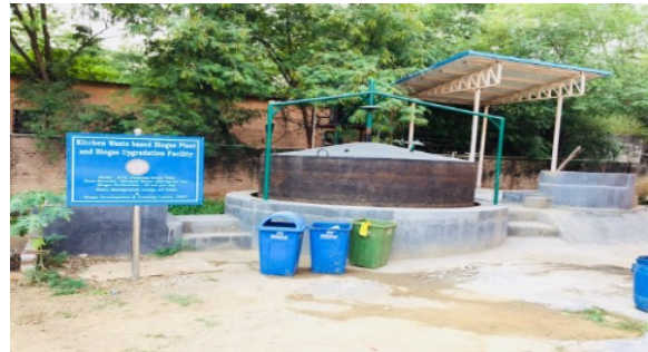
View of anaerobic digester running on kitchen waste

Horticultural waste is composted and used extensively on campus to conserve soil carbon. After segregating for recycling, only 50% of our solid waste reaches the landfills thereby