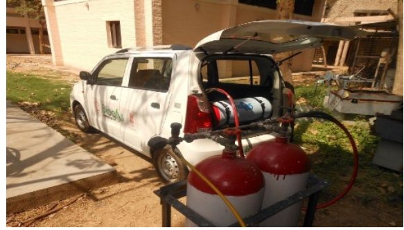
CBG filling in car