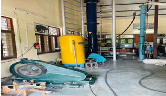
Biogas enrichment and bottling facility

minimising methane emissions. We are working with an NGO Chintan in this regard and plan to become a zero-waste campus soon.